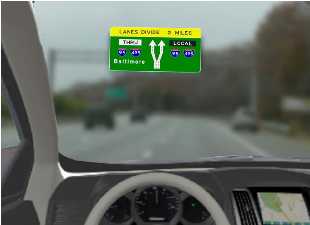
Motorists driving north on I-95 will see new signs as they approach the Thru-Local split on the Outer Loop of the Capital Beltway.

The Woodrow Wilson Bridge now offers motorists two additional lanes in each direction. These "Thru Lanes" will allow travelers to utilize the center-most lanes of the bridge, which mark a