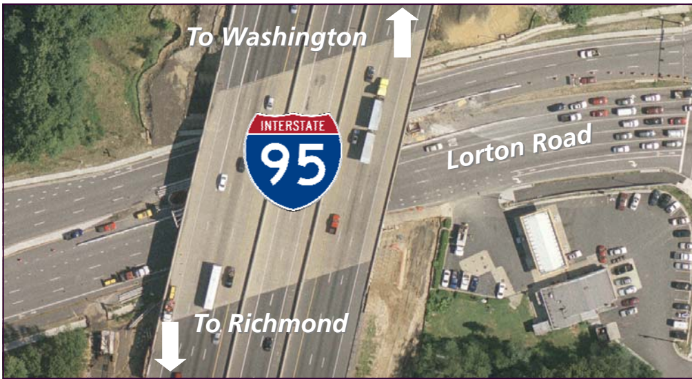
Workers raising steel beams over Lorton Road will reduce lanes and shift traffic starting Jan. 12, 2009.

Project officials encourage motorists to use alternative routes during this work, which is scheduled from 9 p.m. to 5 a.m. each night. At least one pedestrian path will remain open during the night work. For lane closure information, visit www.VAmegaprojects.com